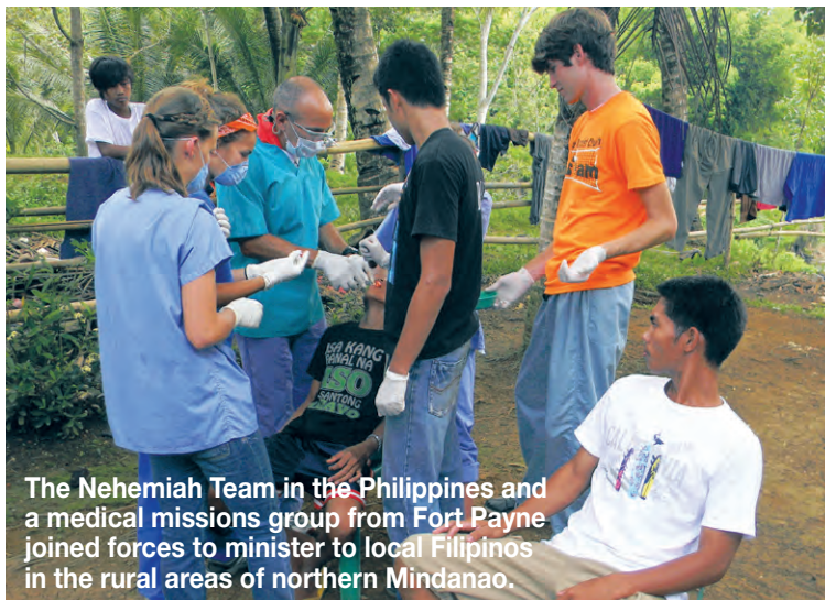
The Nehemiah Team in the Philippines and a medical missions group from Fort Payne joined forces to minister to local Filipinos in the rural areas of northern Mindanao.

The group's daily routine included traveling to rural villages, setting up medical areas and administering medical care to locals, returning to the city after the last patient was cared for or they ran