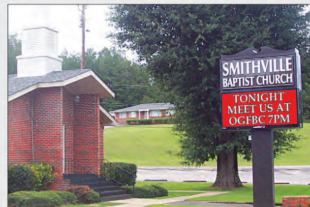
Lighted sign with electronic message board

"Our church decided to purchase a sign from Reliable Signs, and we have been very pleased. They were very patient and not pushy at all. They actually did all they could to get us every rebate and discount possible. The sign is a major tool for us in our community and I tell people all the time 'it's a staff member who never stops spreading the Gospel for our Lord.'"