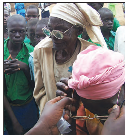
Ugandans stand in line to receive eyeglasses, some of which were donated by Sulphur Springs Baptist Church, Trussville.