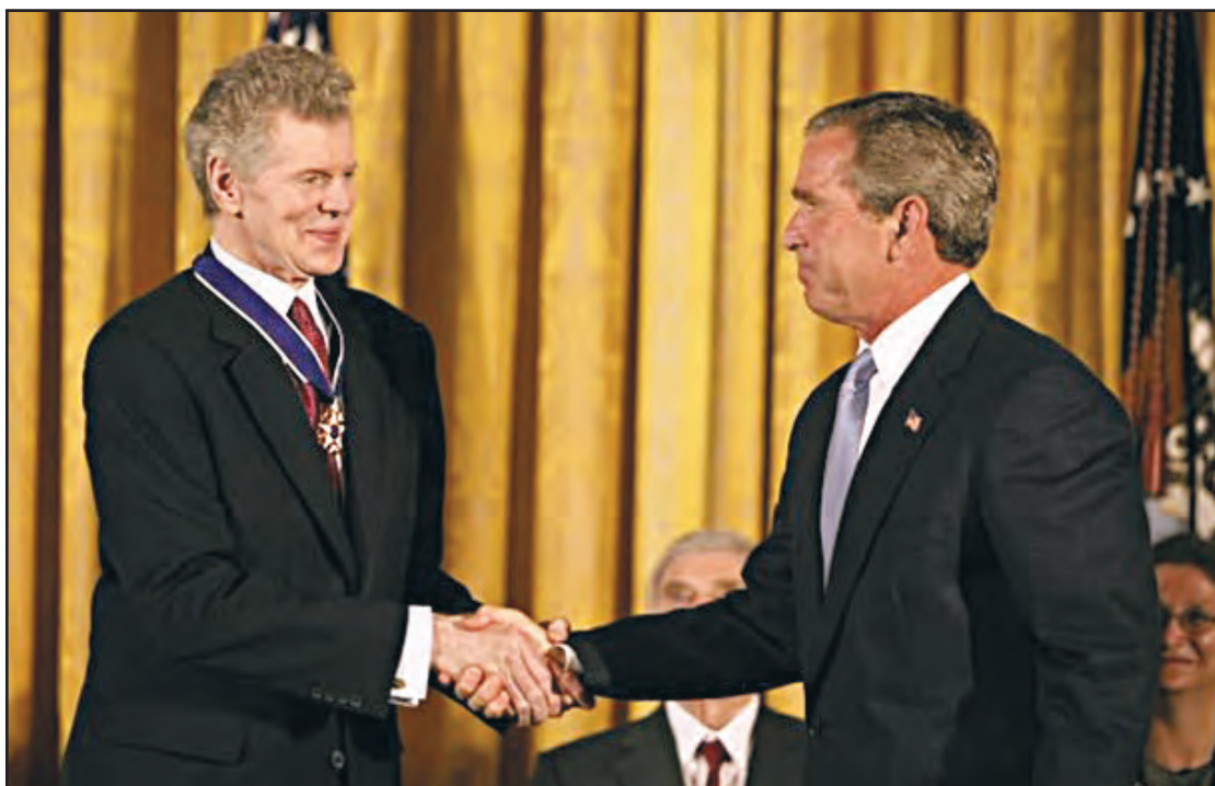
Van Cliburn (left) is awarded the Presidential Medal of Freedom by George W. Bush in 2003.