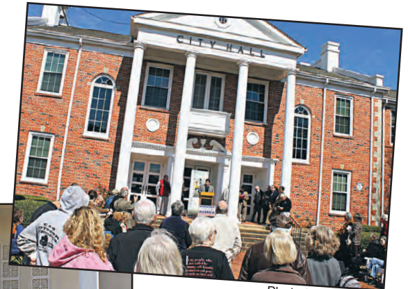
BUTLER COUNTY