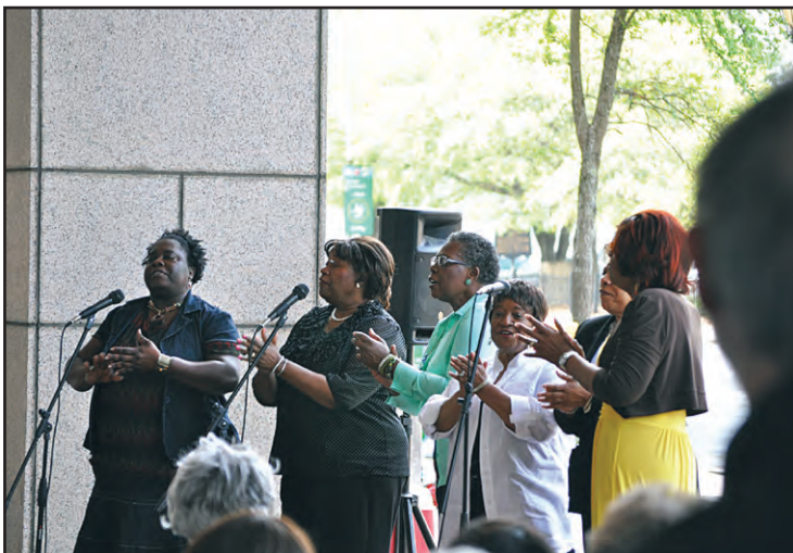
MOBILE COUNTY