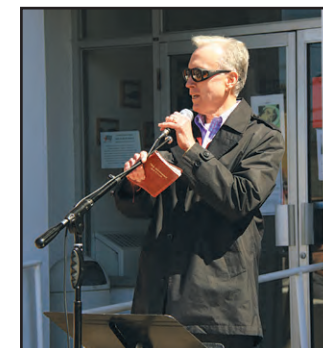
LAMAR COUNTY

"Now we need to continue to ask our Lord for a spiritual awakening in our nation. May this effort be a step in that breakthrough." (TAB)