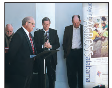
ESCAMBIA COUNTY