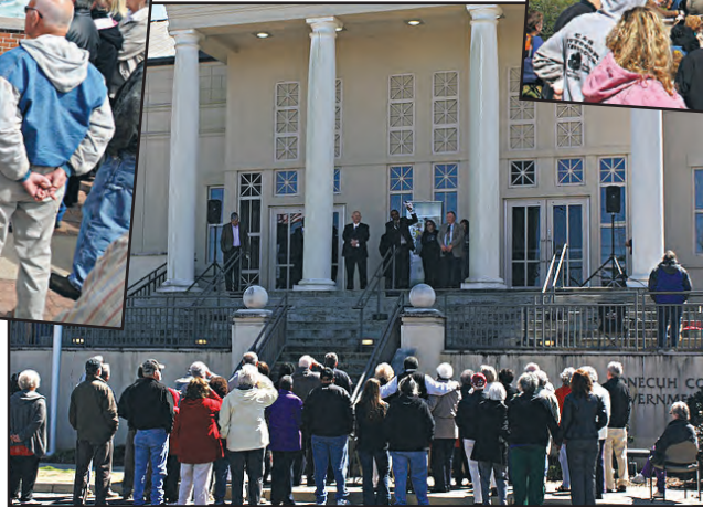
CONECUH COUNTY