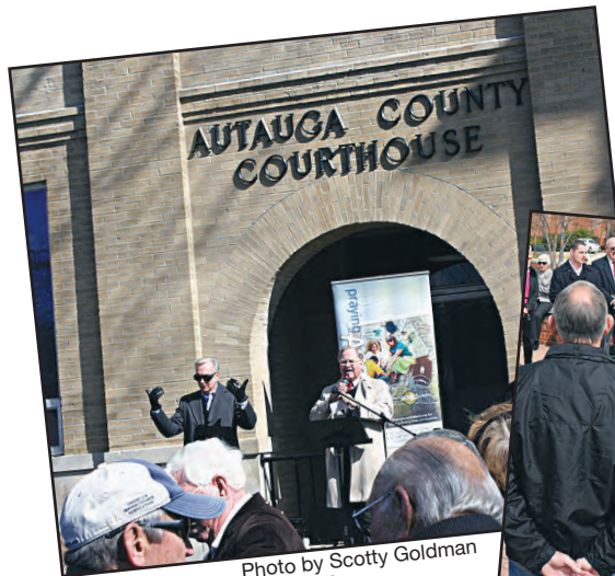
AUTAUGA COUNTY