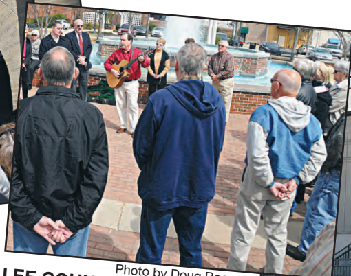
LEE COUNTY