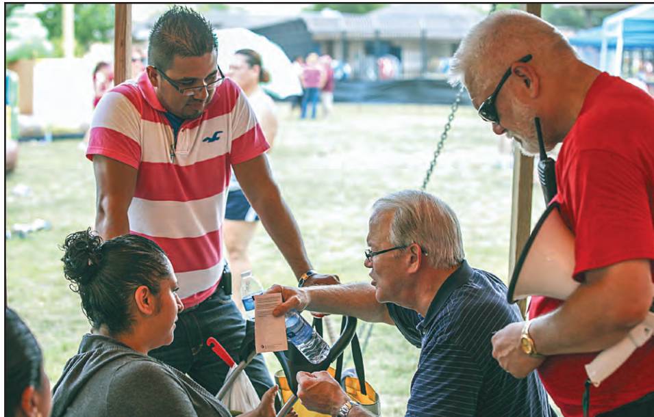
Frank S. Page (center), president of the SBC Executive Committee, shares the gospel at a block party during Crossover Houston in 2013.

The outreach — with its block parties and door-to-door evangelism efforts — will di-