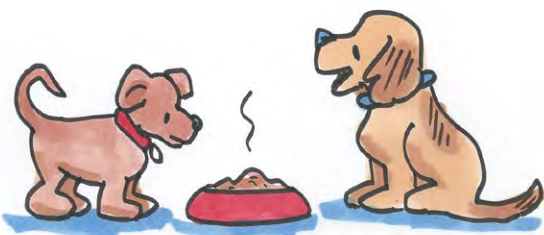
The Pastor's Dogs

"WE GET A LOT OF LEFTOVERS FROM CHURCH DINNERS. I HOPE YOU LIKE SWEET POTATO CASSEROLES."