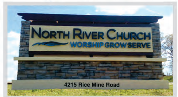
4215 Rice Mine Road