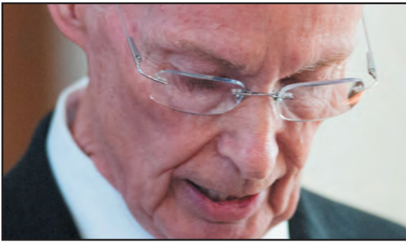
Former Gov. Robert Bentley