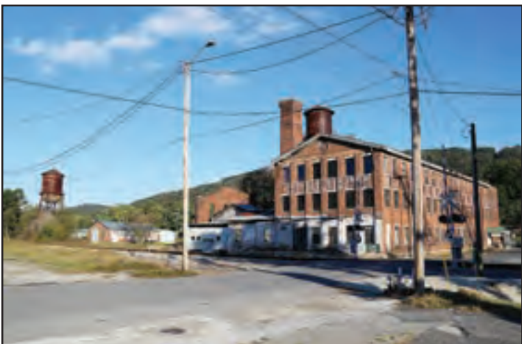
The 'old mill' (pictured here) in downtown Fort Payne is where countless socks were made. In the 1950s the leftover dye was dumped in the local branch (photo above) each day, giving it the name Dye Branch.

Left: Wallace Avenue NE cuts off the open flow of Dye Branch, which runs behind the railroad tracks in Fort Payne. The branch served as a backdrop for many adventures in Bobby Welch's childhood.