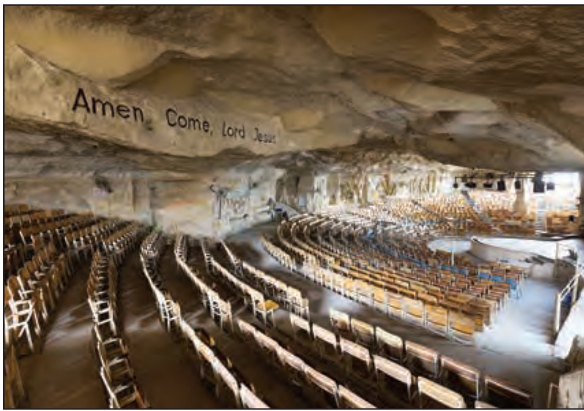
Pictured here is the sanctuary of the Cave Church in Garbage City, Cairo, Egypt. Egypt was ranked 17th on Open Doors' 2018 World Watch List of the countries where it is most difficult to be a Christian.