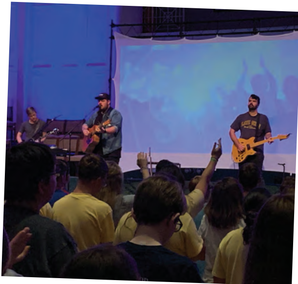
More Than This leads worship.