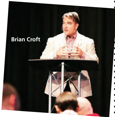
most of our churches.