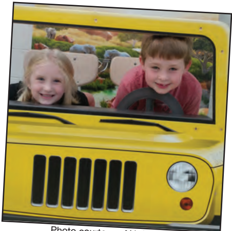
VBS students got behind the wheel of a safari jeep to go 'Into the Wild' at Heflin Baptist Church.