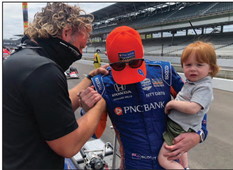
IndyCar Ministry chaplains work on building relationships with drivers and team members.

"They trust me because I can't pretend to be something I'm not," Holt