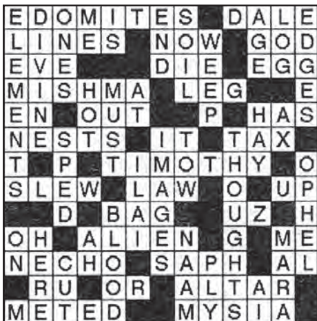
The crossword puzzle can be found on page 19.

For more information or to view past webinars, visit pinnaclealabama.org .