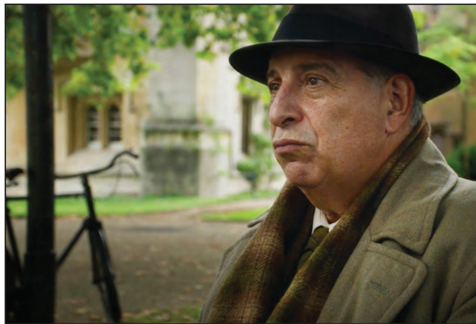
'THE MOST RELUCTANT CONVERT'