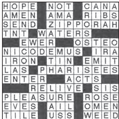
The crossword puzzle can be found on page 15.