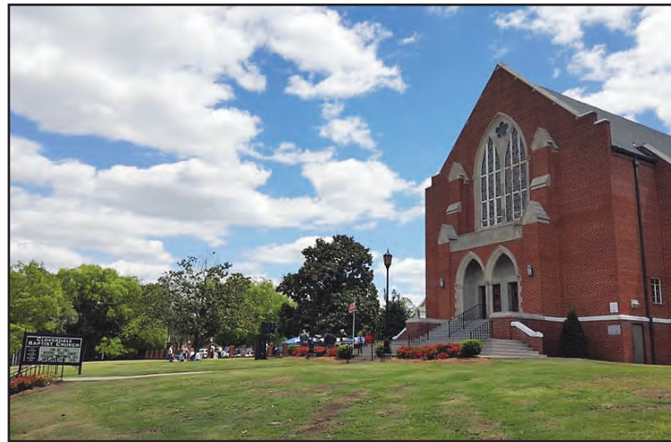
Cloverdale Baptist Church in Montgomery is in the process of selling its building to Wesley Church, a Global Methodist congregation.