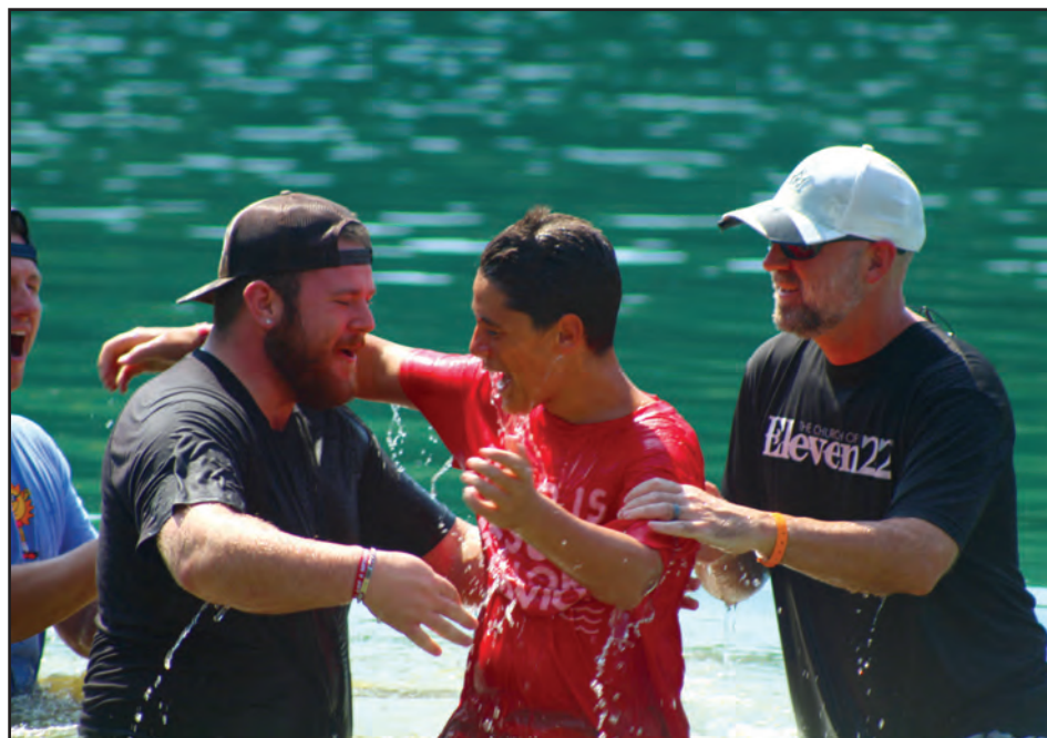
When students come to Christ during their summer camp experience, church leaders sometimes hold a baptism service at Shocco before heading home — such as what took place with the Florida church group above this summer.

Today, if you walk to the chapel yard or up around Twin Lodge, you'll see those same