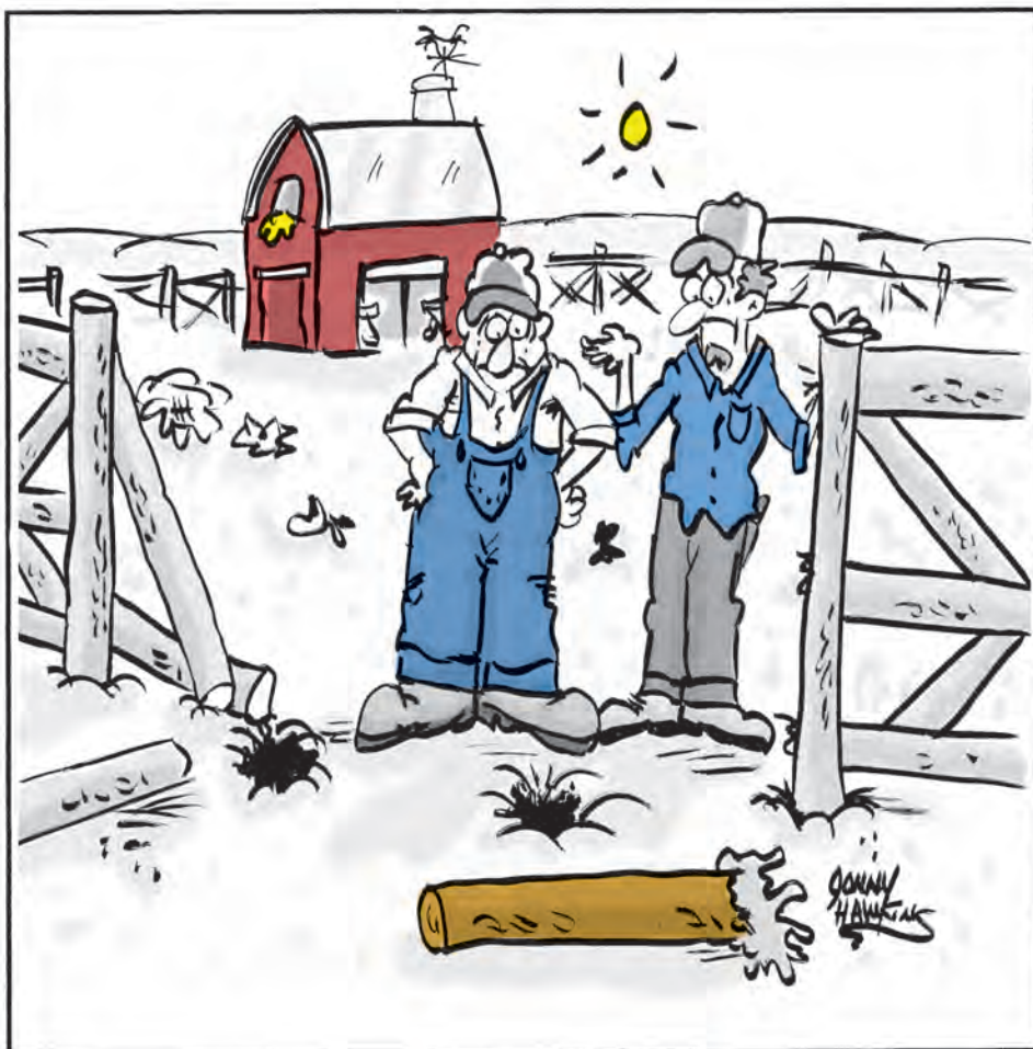
Posts were removed because someone took a fence.